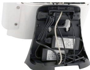
Spacious stand storage space