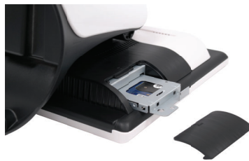
Easy disassembly for A/S process