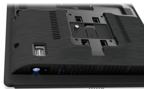
Easy USB connection