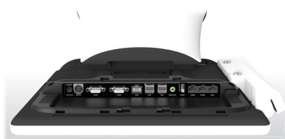
Arranged in a row I/O port